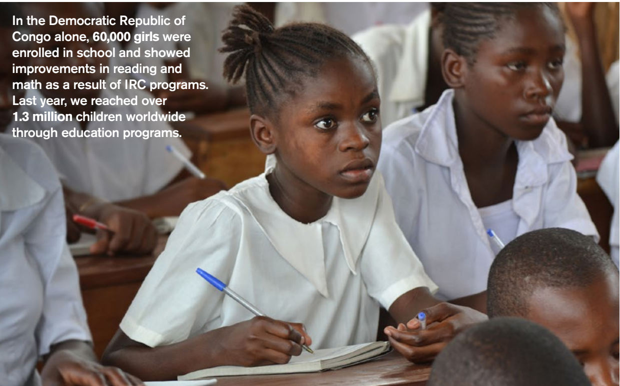
In the Democratic Republic of Congo alone, 60,000 girls were enrolled in school and showed improvements in reading and math as a result of IRC programs. Last year, we reached over 1.3 million children worldwide through education programs.