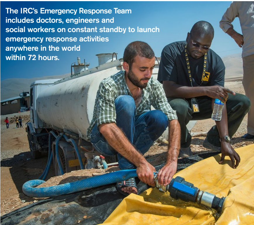
The IRC’s Emergency Response Team includes doctors, engineers and social workers on constant standby to launch emergency response activities anywhere in the world within 72 hours.