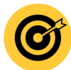
Figure 3: Commitments to Ensure Impact

In order to maximize impact and achieve priority outcomes, the IRC in Afghanistan is making new investments to improve program effectiveness, use resources more efficiently, reach more people more quickly, and be more responsive to clients and partners. The IRC made the following commitments to strengthen programming and improve the lives of the people we serve in Afghanistan.