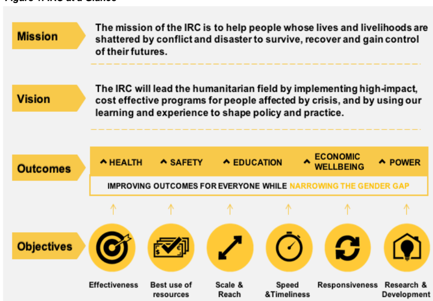
Figure 1: IRC at a Glance

The International Rescue Committee's (IRC) mission is to help the world's most vulnerable people survive, recover, and gain control of their future. The aim of the IRC's global strategy, IRC2020 (shown at right), is to make measurable improvements in health, safety, education, economic wellbeing, and decision-making power. Therefore, the IRC has made investments to improve program effectiveness, use resources more efficiently, reach more people more quickly, and better respond to clients' needs.