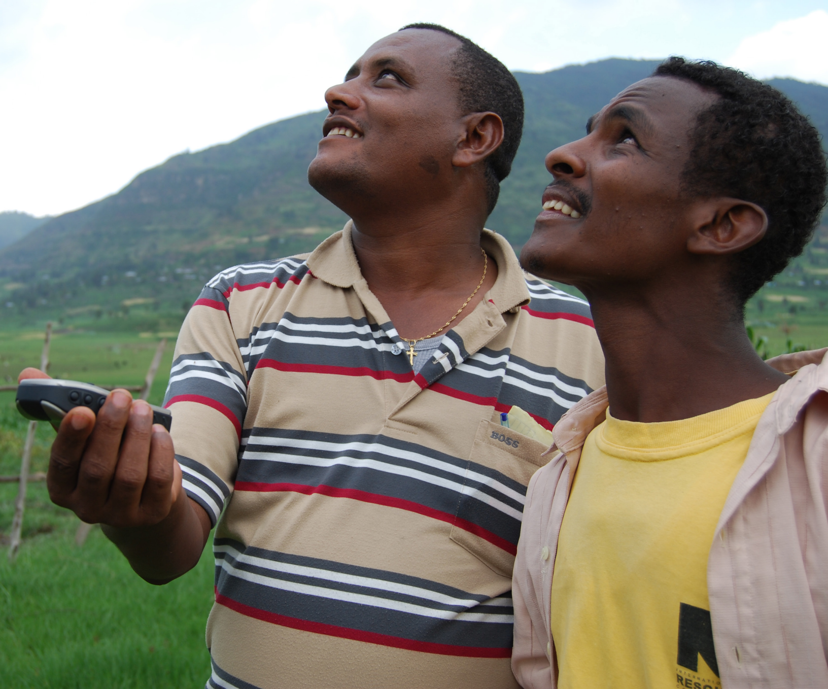
ABOVE SINCE 2003, THE IRC HAS BEEN USING SATELLITE IMAGES, DIGITIZED MAPS, AND AERIAL PHOTOGRAPHS COLLECTED IN THE FIELD USING GPS TECHNOLOGY TO PINPOINT AREAS THAT LACK POTABLE WATER AND IDENTIFY NEW WATER SOURCES.