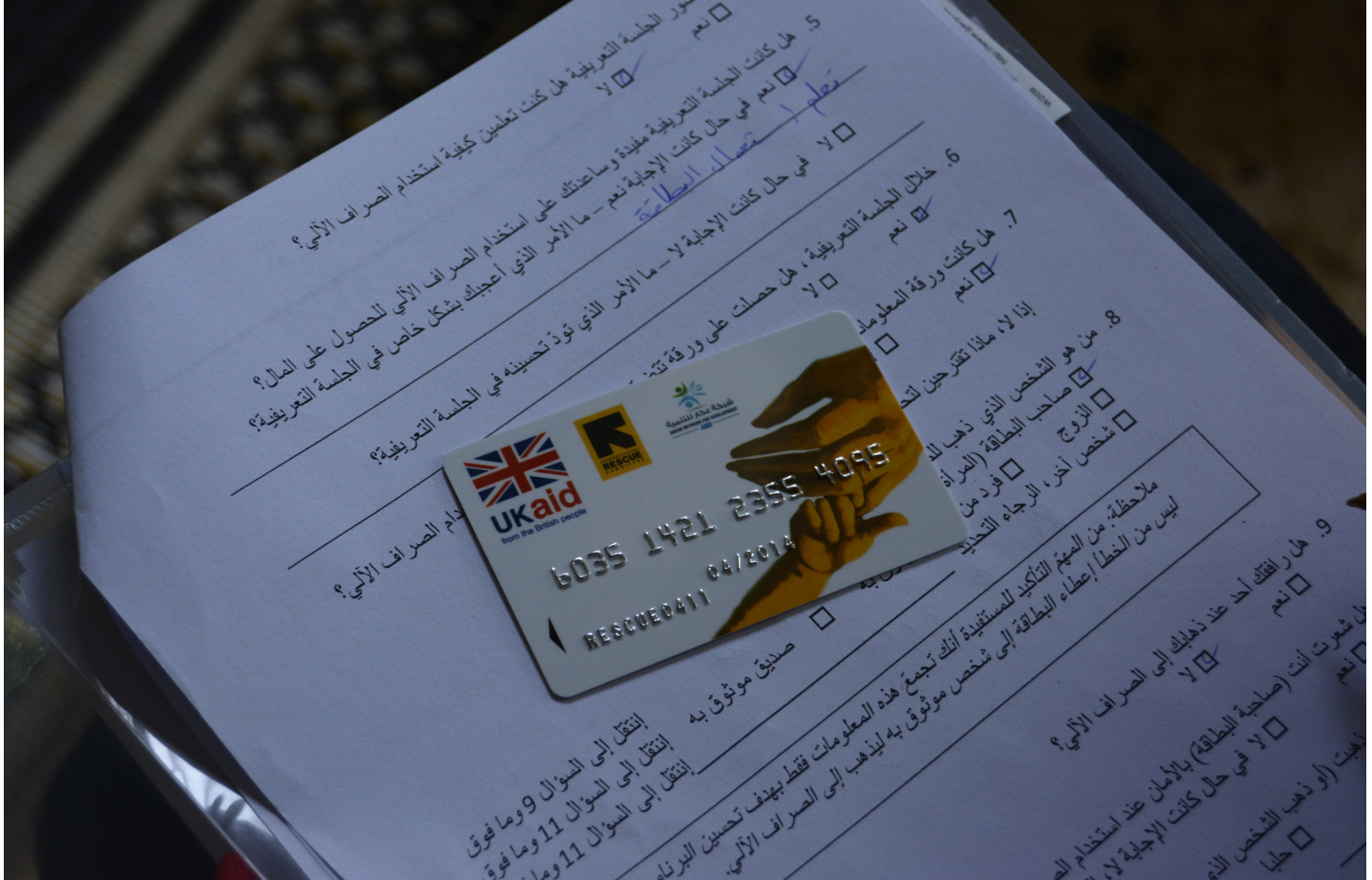
ABOVE THE IRC PROVIDES THIS ATM CARD TO HUNDREDS OF SYRIAN REFUGEE FAMILIES. IT CAN BE USED TO WITHDRAW A MONTHLY AMOUNT TO PAY FOR RENT, FOOD, UTILITIES OR OTHER ESSENTIALS.