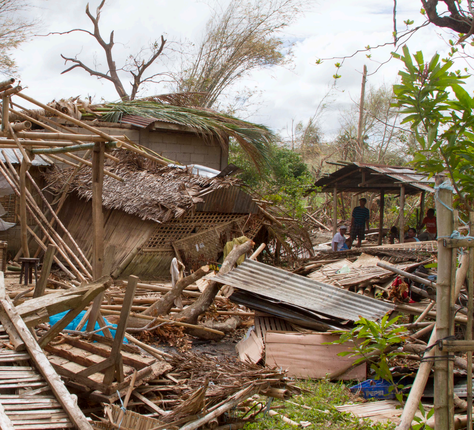
ABOVE PHILIPPINES IN THE WAKE OF TYPHOON HAIYAN