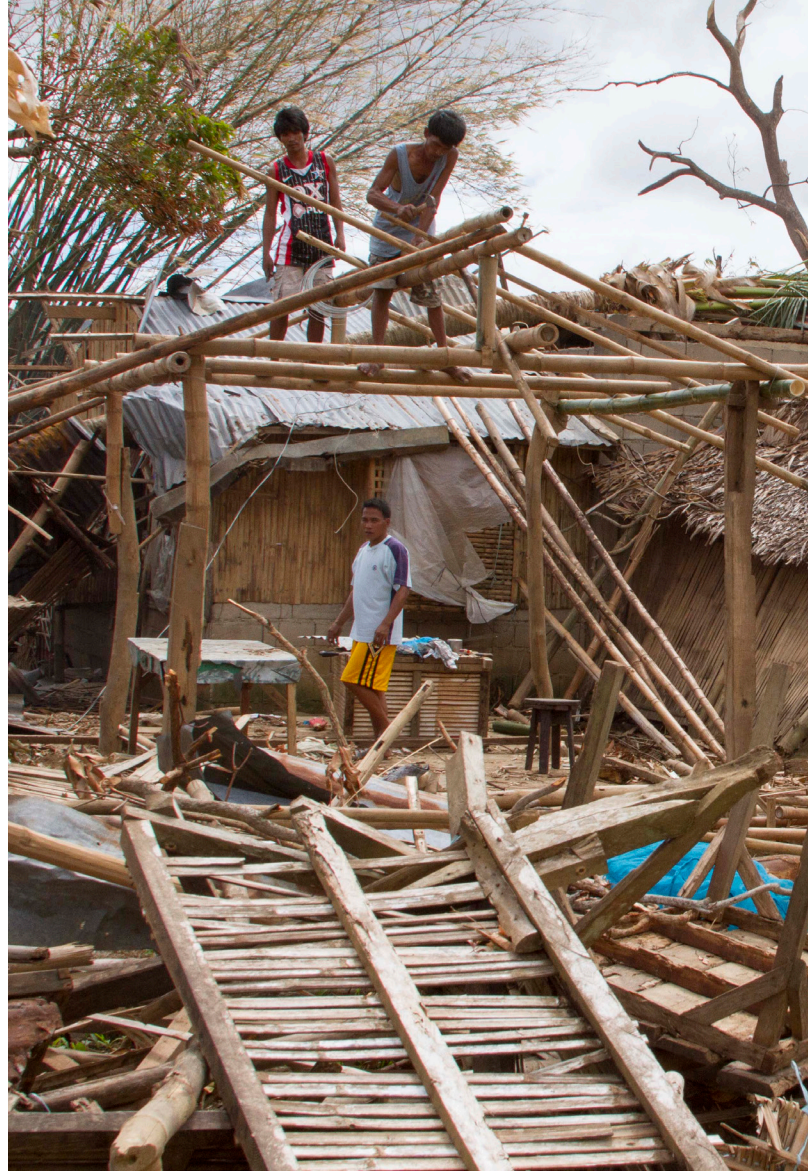
ABOVE PHILIPPINES IN THE WAKE OF TYPHOON HAIYAN

In both countries, the ROI analyses focus on card payments. In Lebanon, this is the primary e-payment mechanism, and mobile payments are not currently a viable option. In the Philippines, the research team initially set out to focus on mobile money payments given the significant investments that have been made in expanding the coverage of mobile money networks. However, uptake for mobile money has been disappointing in its ten years of existence, with a reported 3 percent of registered accounts being active. Improving ATM and POS infrastructure makes card payments a more reasonable payment mechanism.