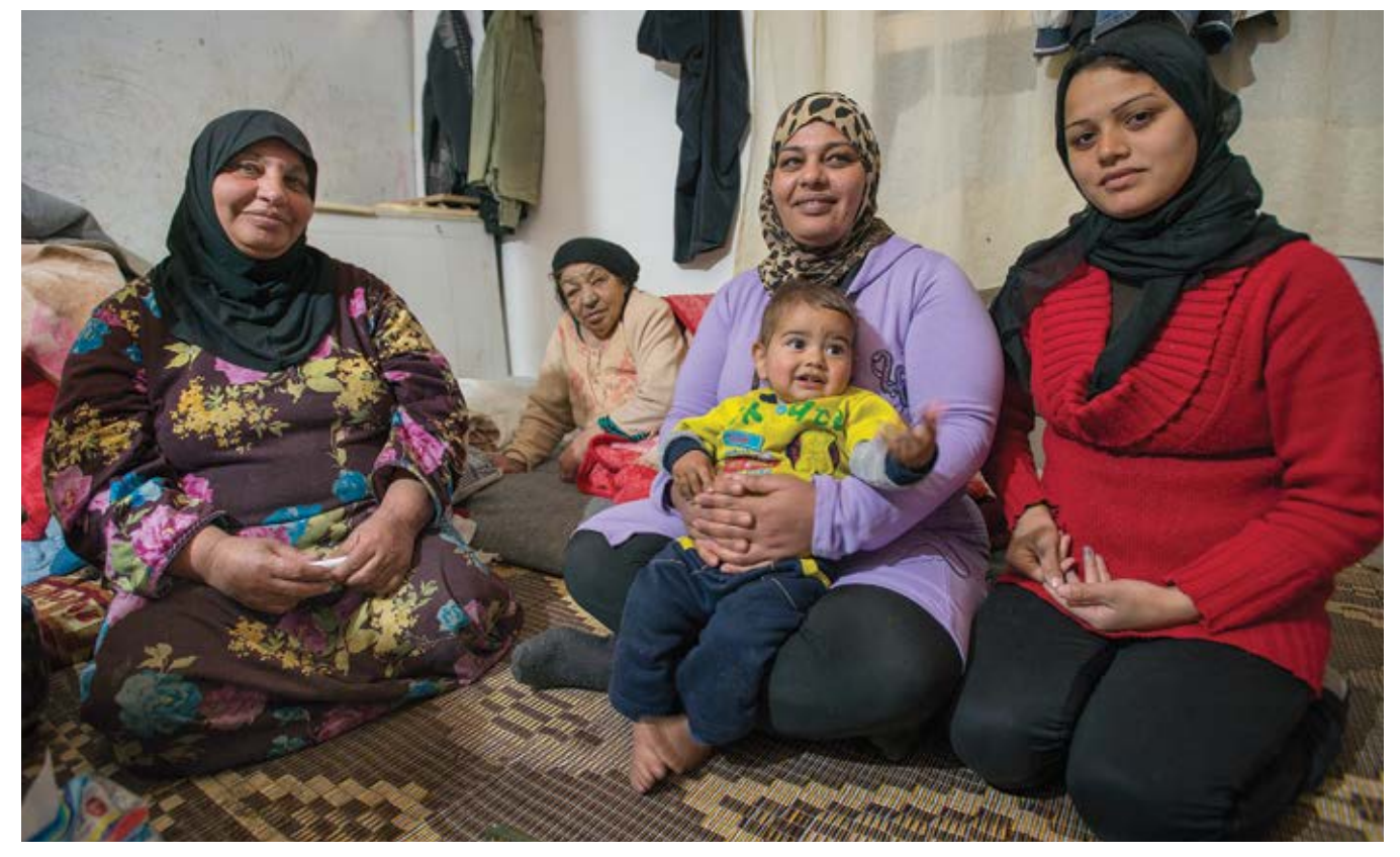
Five generations of the same family from Syria are now living as refugees in Northern Lebanon.

The IRC intends to expand child protection services throughout the region by identifying unaccompanied minors and other at-risk refugee children, assessing their needs, and ensuring that they have access to case management, education and other services. All services will be tailored to local conditions: in Iraq and Turkey, children will have access to safe places to play and learn. In Lebanon, programs will address the special needs of street children. In Lebanon and Jordan, efforts will be made to find foster families to care for unaccompanied children in refugee camps.