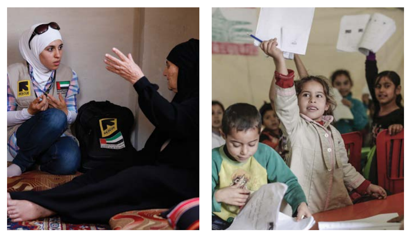
LEFT: An IRC community health volunteer speaks to a Syrian refugee living in Jordan about the IRC's health services. RIGHT: Syrian refugee children at an IRC education center in Lebanon.