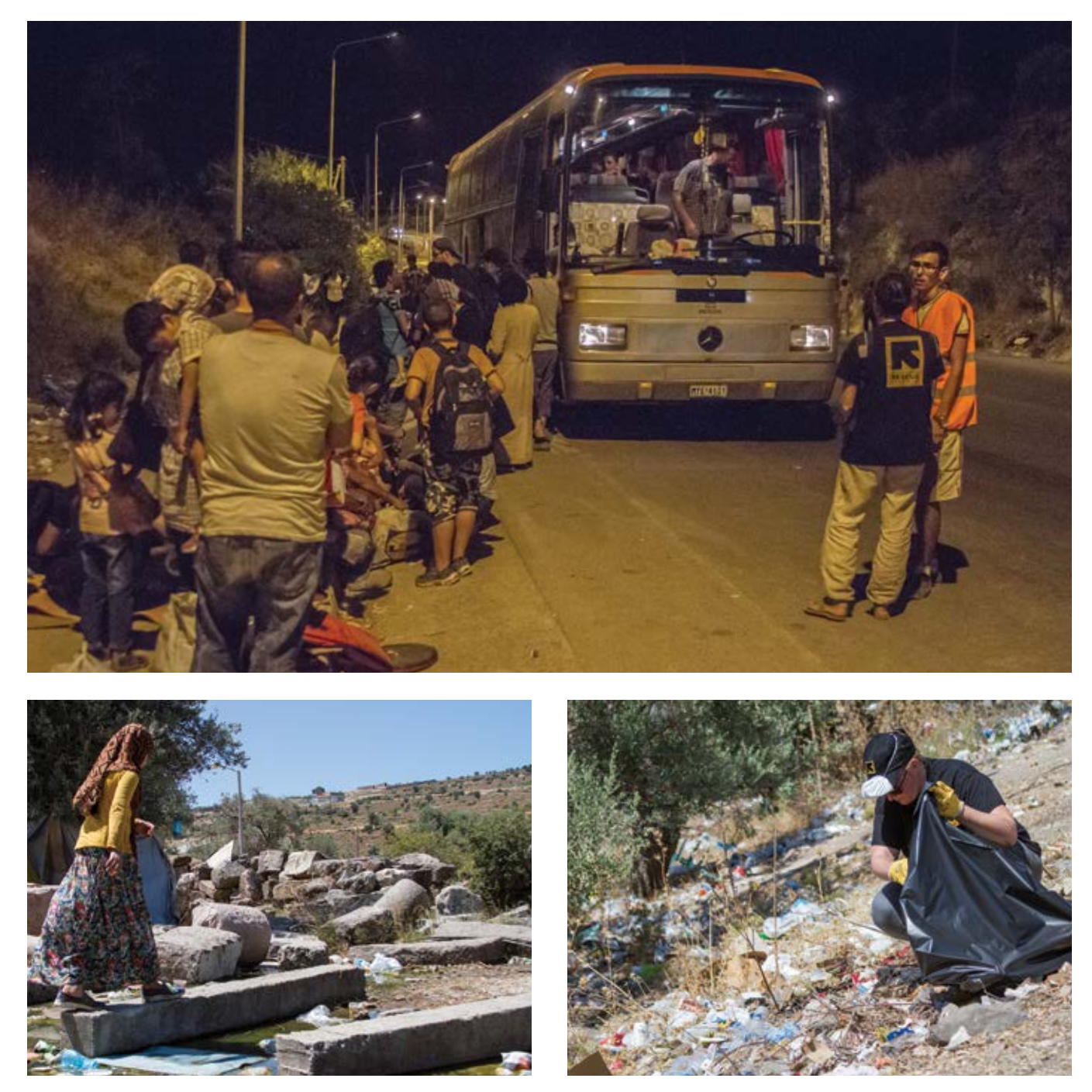
TOP: To alleviate the crowding on Lesbos, the IRC helped arrange for buses to transport refugees to the north of the island where they can take a ferry to the mainland. ABOVE LEFT: Water points at Kara Tepe camp are often filled with trash and surrounded by dirty pooling water. ABOVE RIGHT: An IRC aid worker collects trash at Kara Tepe camp.

Only half of the families at Kara Tepe have any shelter. Women and girls have no private or safe spaces. Relief workers attempt to identify vulnerable people, such as victims of human trafficking, but conditions are so cramped and chaotic that it is extremely difficult to do so. There is only one other camp (run solely by volunteers) available for vulnerable refugees, like unaccompanied children, and water and sanitation conditions there are deficient.