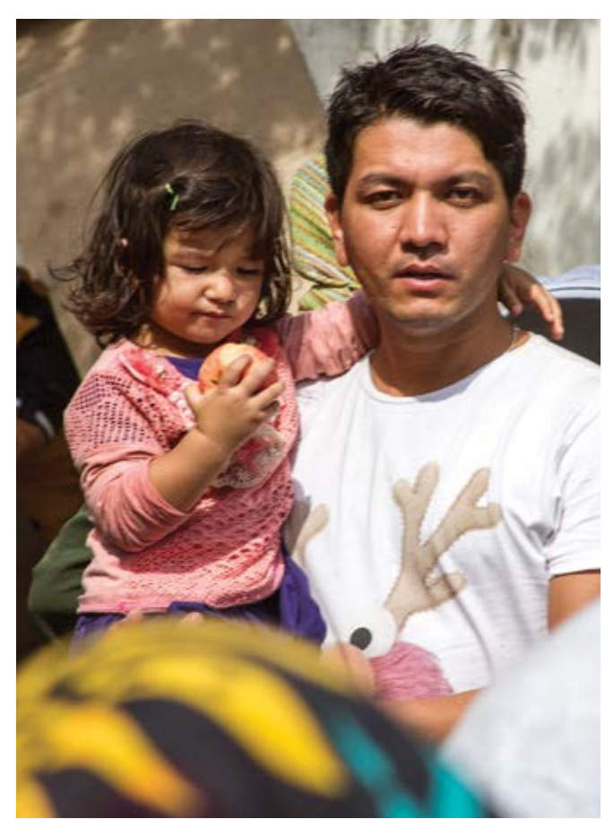
A father and child after landing on the beach in Lesbos, Greece.

Yet, as the number of refugees has surged, it has also become harder for them to travel to Europe legally. European countries have restricted visas once available to refugees,